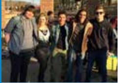
Winning Band Pilot