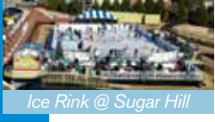
Ice Rink @ Sugar Hill