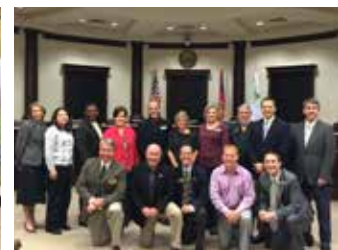
The City Council celebrated the Teachers of the Year at the November Council Meeting