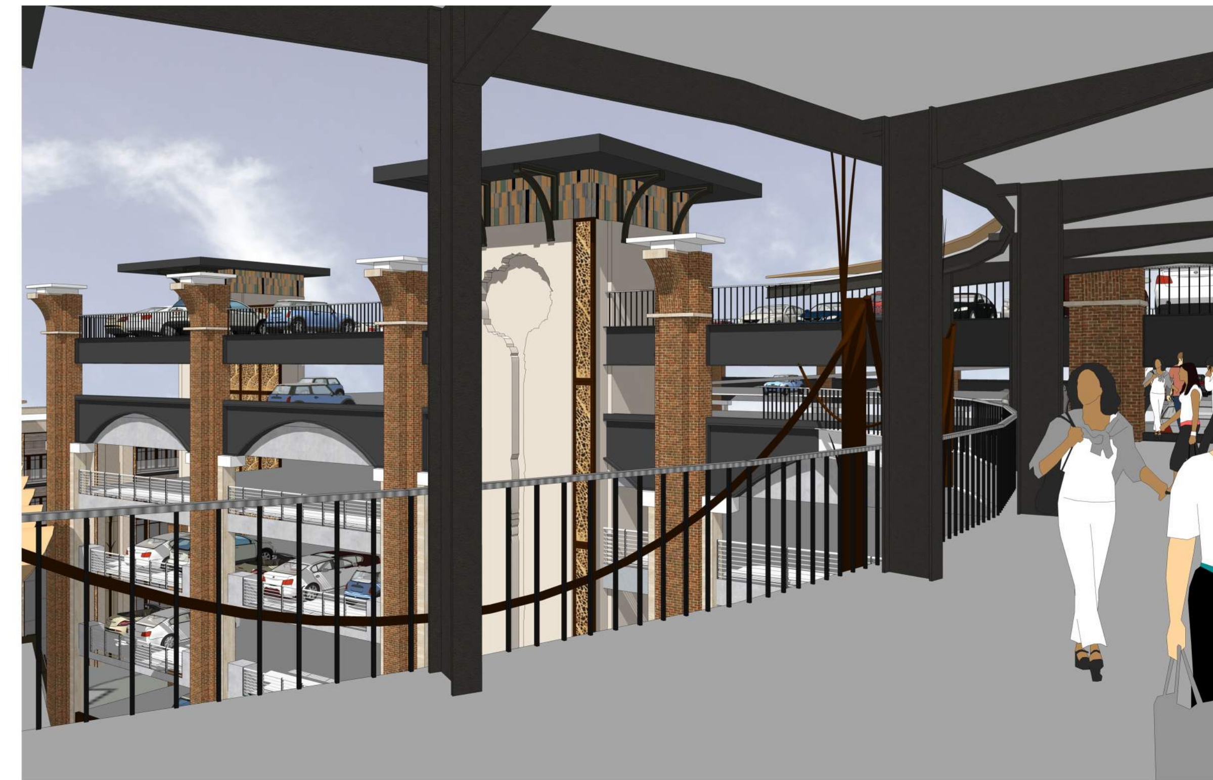
PARKING STRUCTURE AND PEDESTRIAN BRIDGES