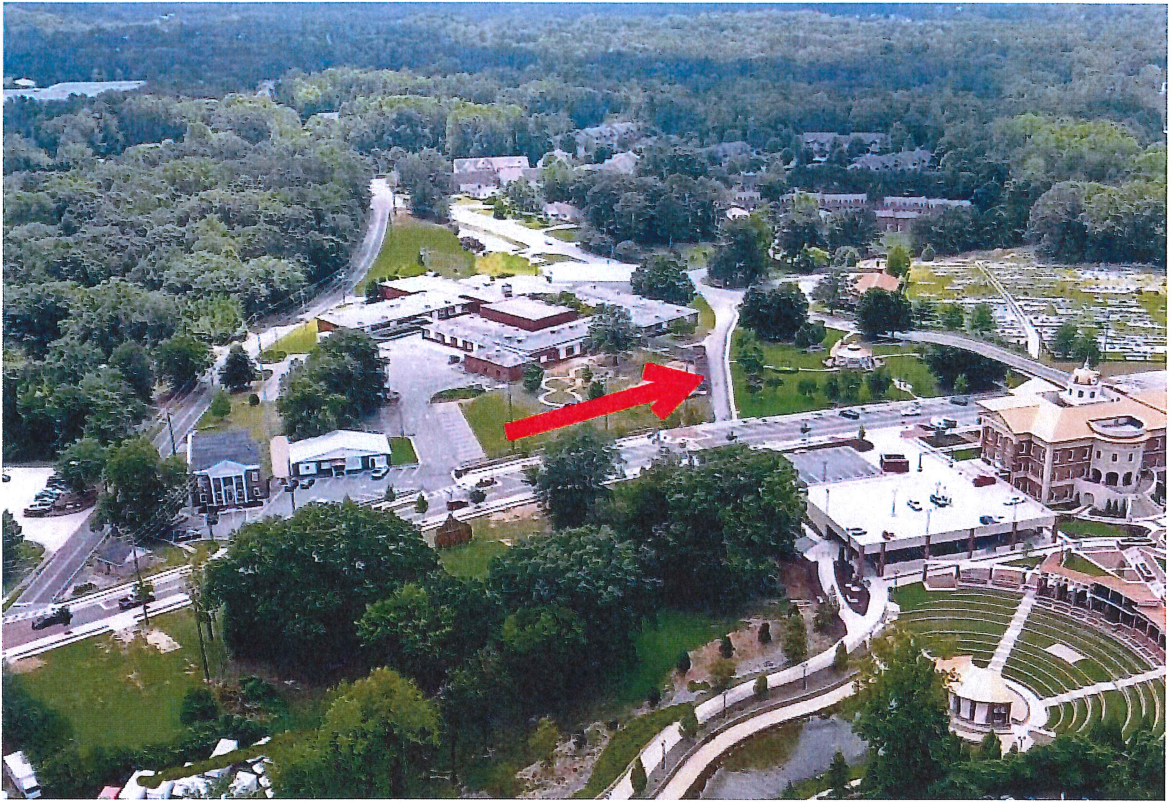
Current Aerial View Looking South