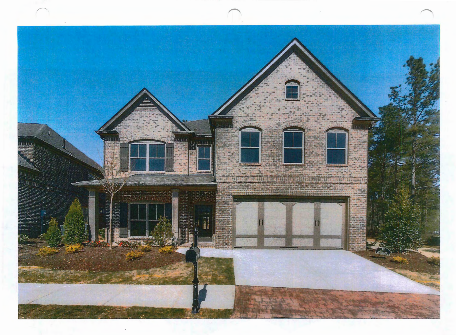
Exhibit 1 11 of 14