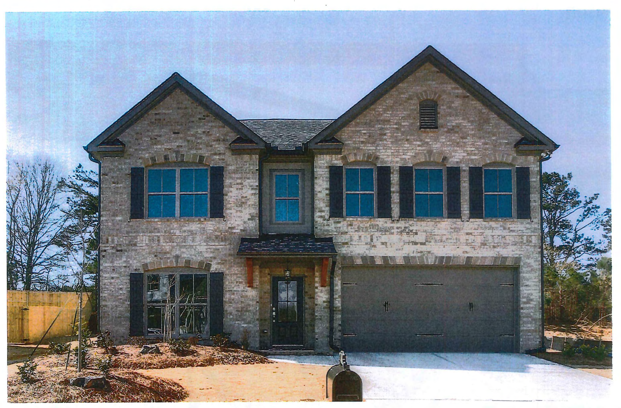
Exhibit 4 4 of 14