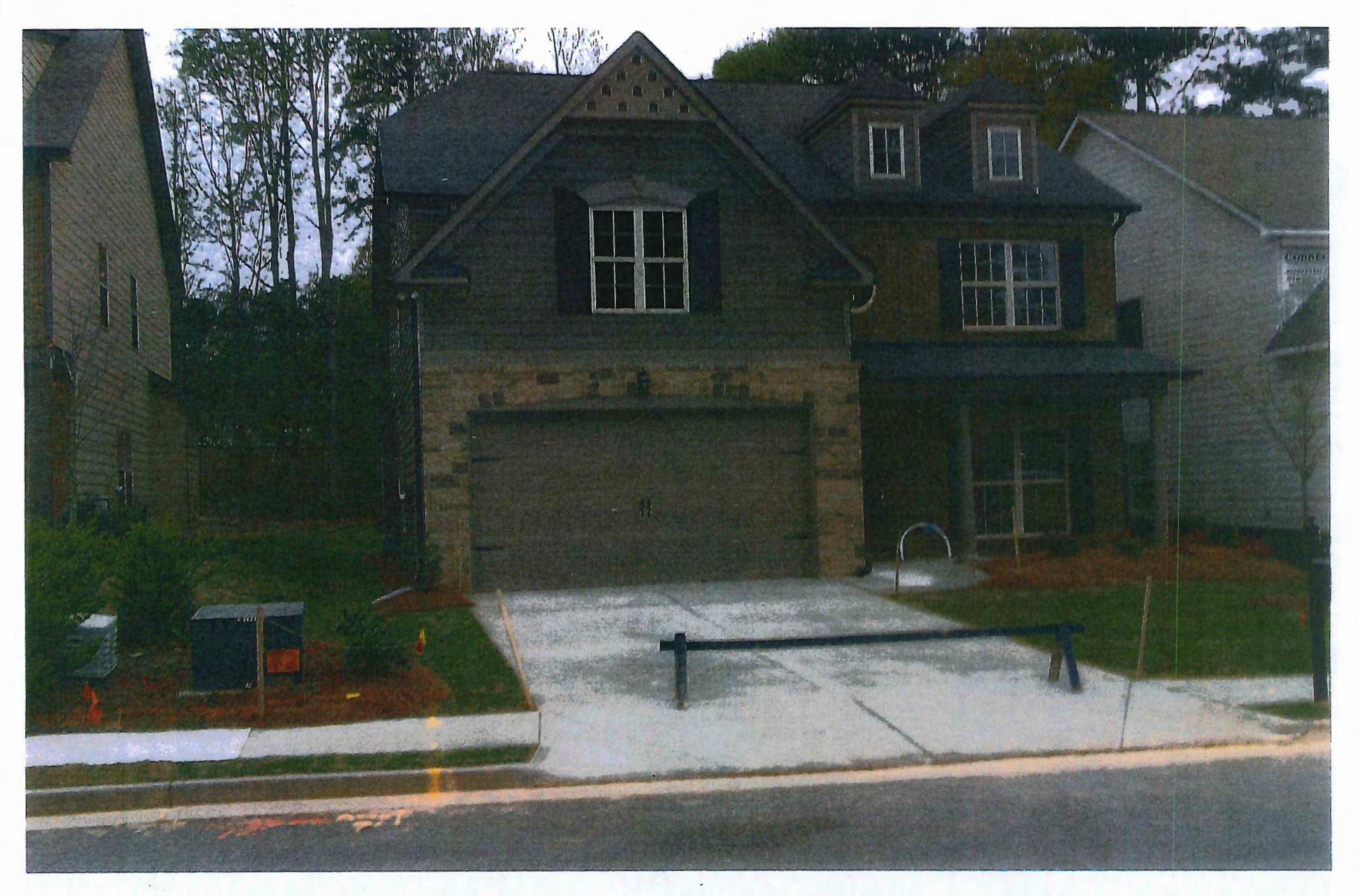
Exhibit 4 14 of 14