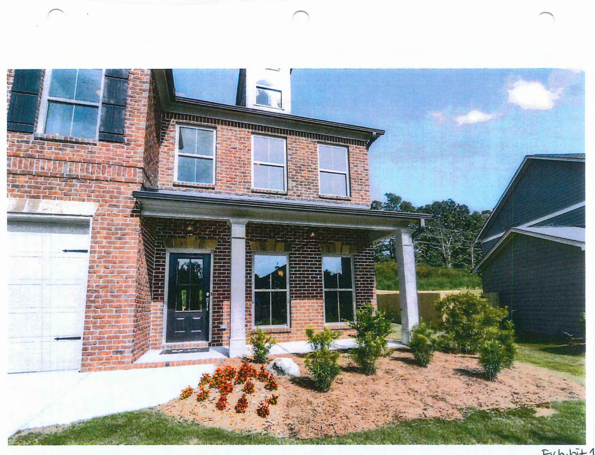
Exhibit 1 7 of 14