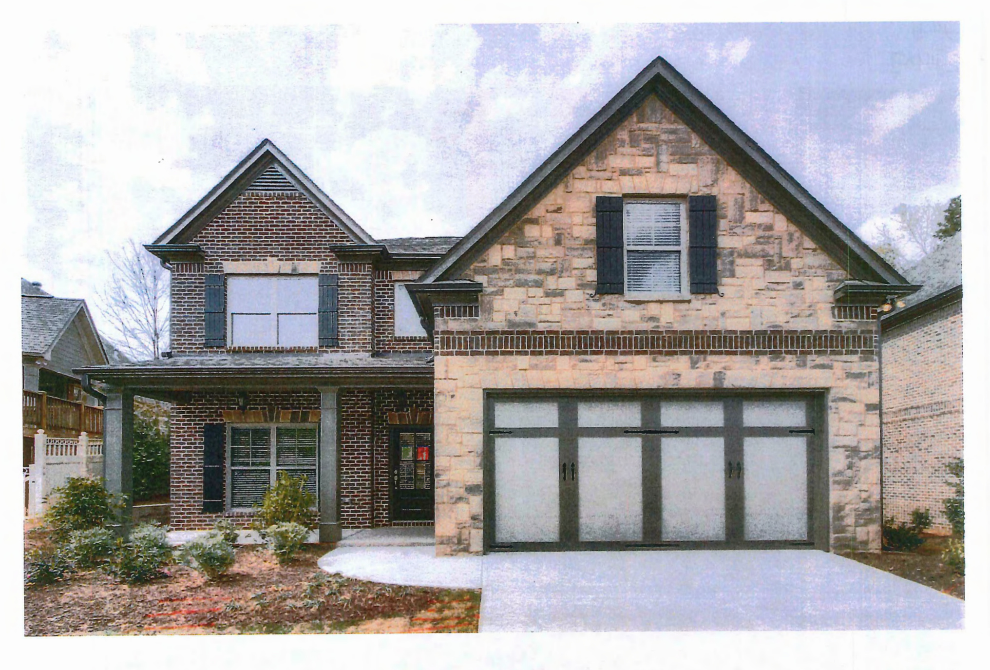
Exhibit 1 10 of 14