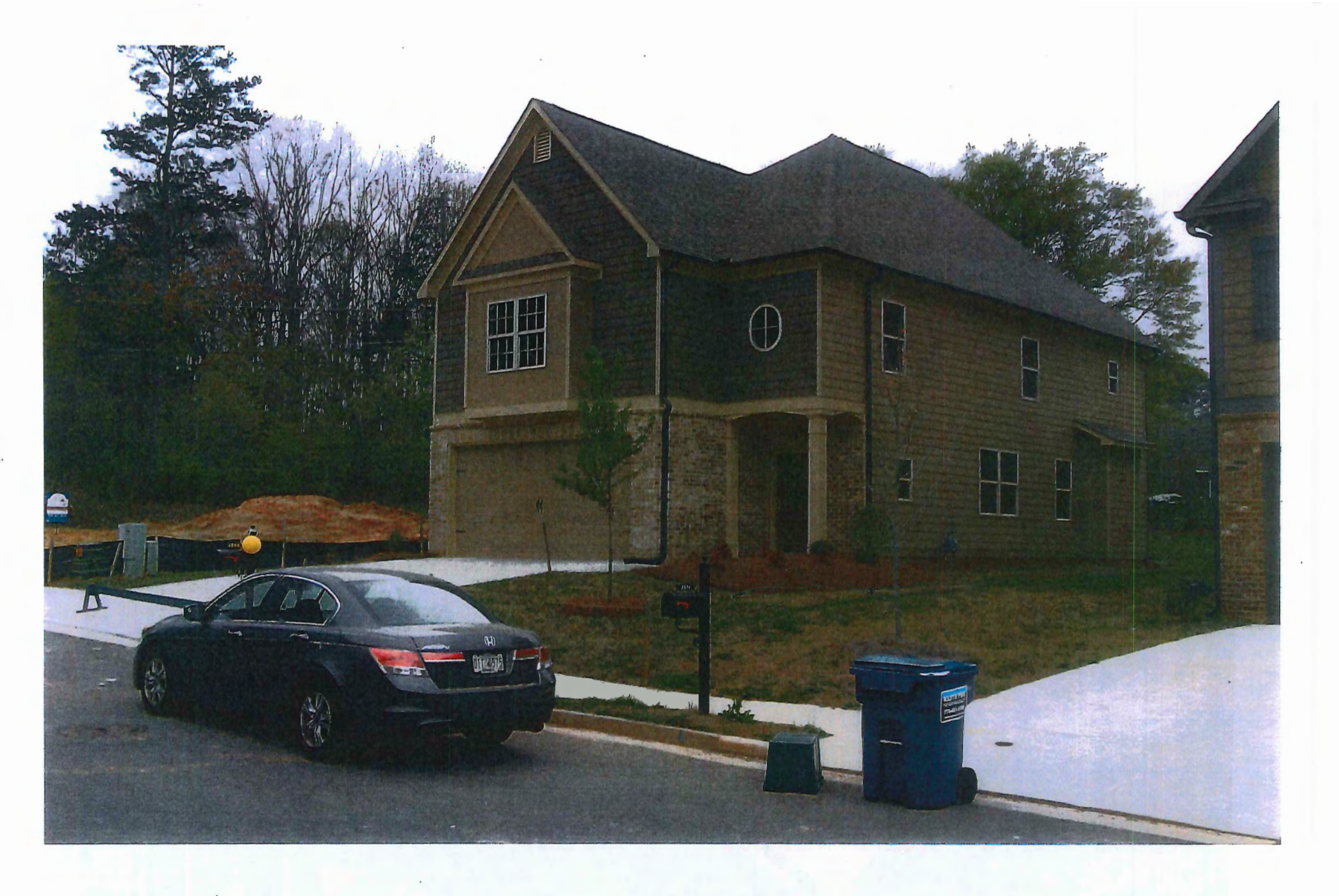
Exhibit 4 12 of 14