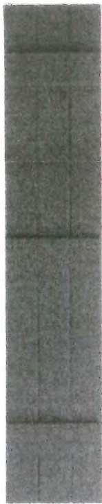
Craftsman Style Shutter