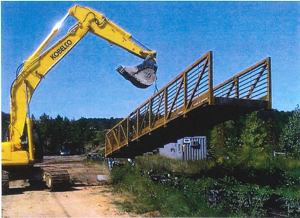
Resaca Battlefield Improvement Project Photo – Courtesy of TSI