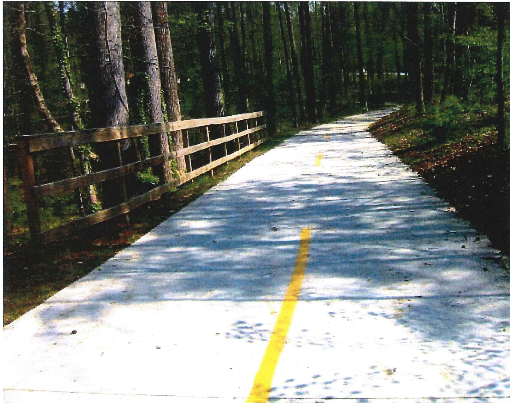
Brooks Run Park Trail Photo – Courtesy of TSI