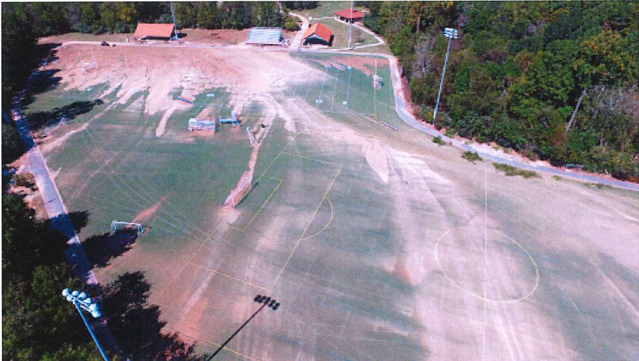
Aerial view looking west

The scope of work will include all materials, labor, tools, equipment and all other items necessary for the replacement of approximately 250,000 square feet of damaged turf on the west side of the park as shown/outlined below. The turf system includes a minimum 2.5” polyethylene slit-film fiber, two full size soccer fields with inlaid yellow, one mini soccer field, one full size football field with inlaid white lines and yardage numbers and a 30/70 sand/rubber infill system.