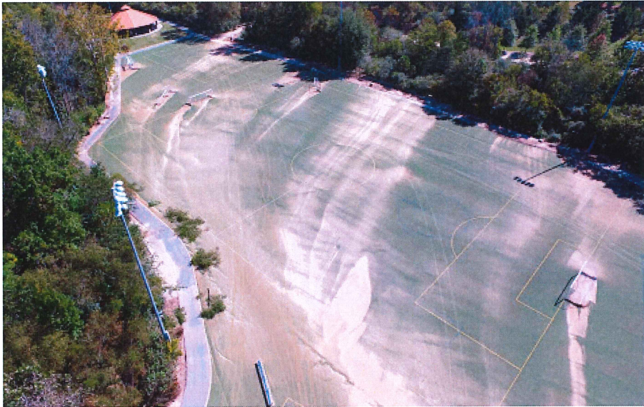
Aerial view looking east over west field