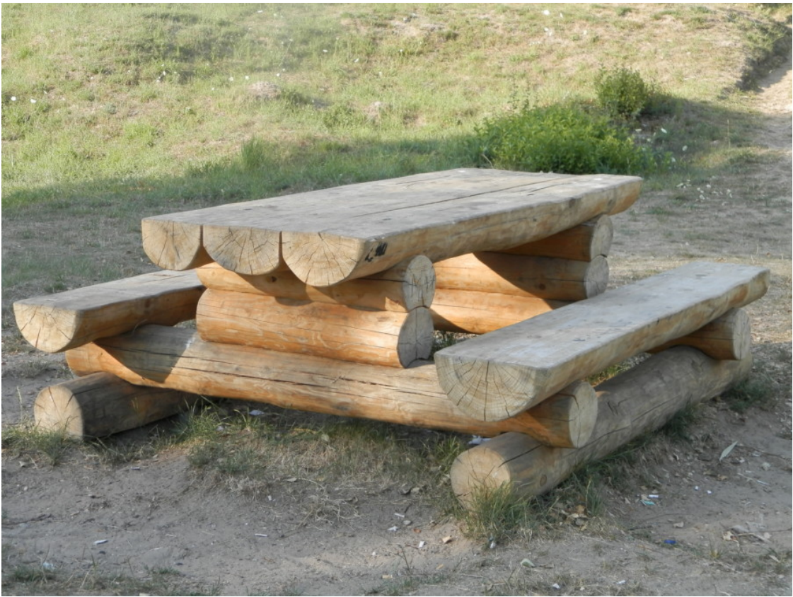
Picnic tables should be of a unique style.