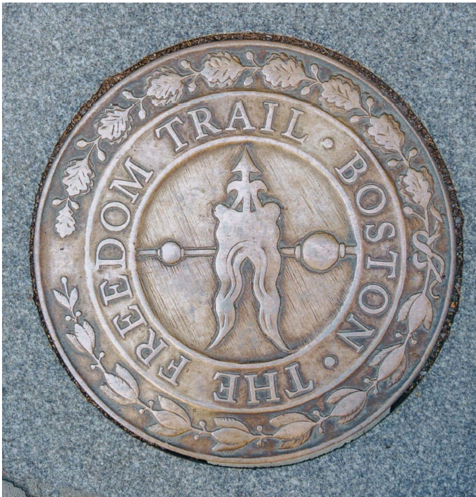
Mile Marker Zero Medallion.