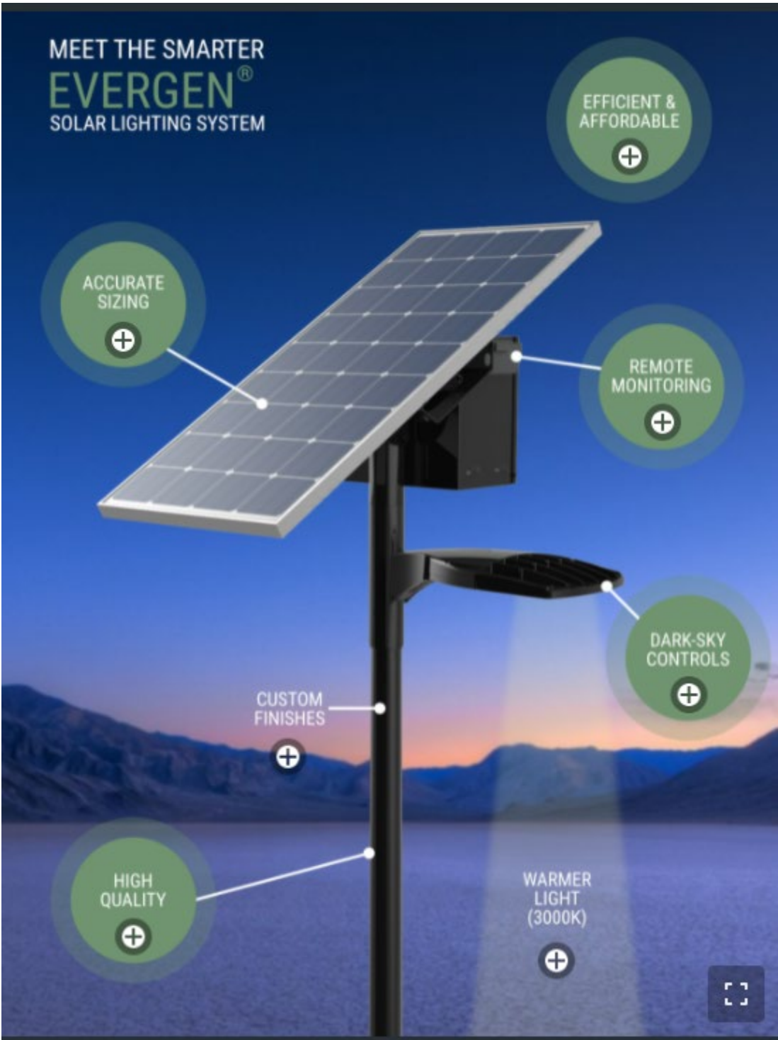
Area lighting example