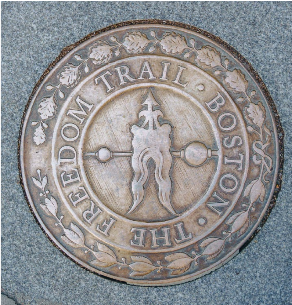
Mile Marker Zero Medallion.