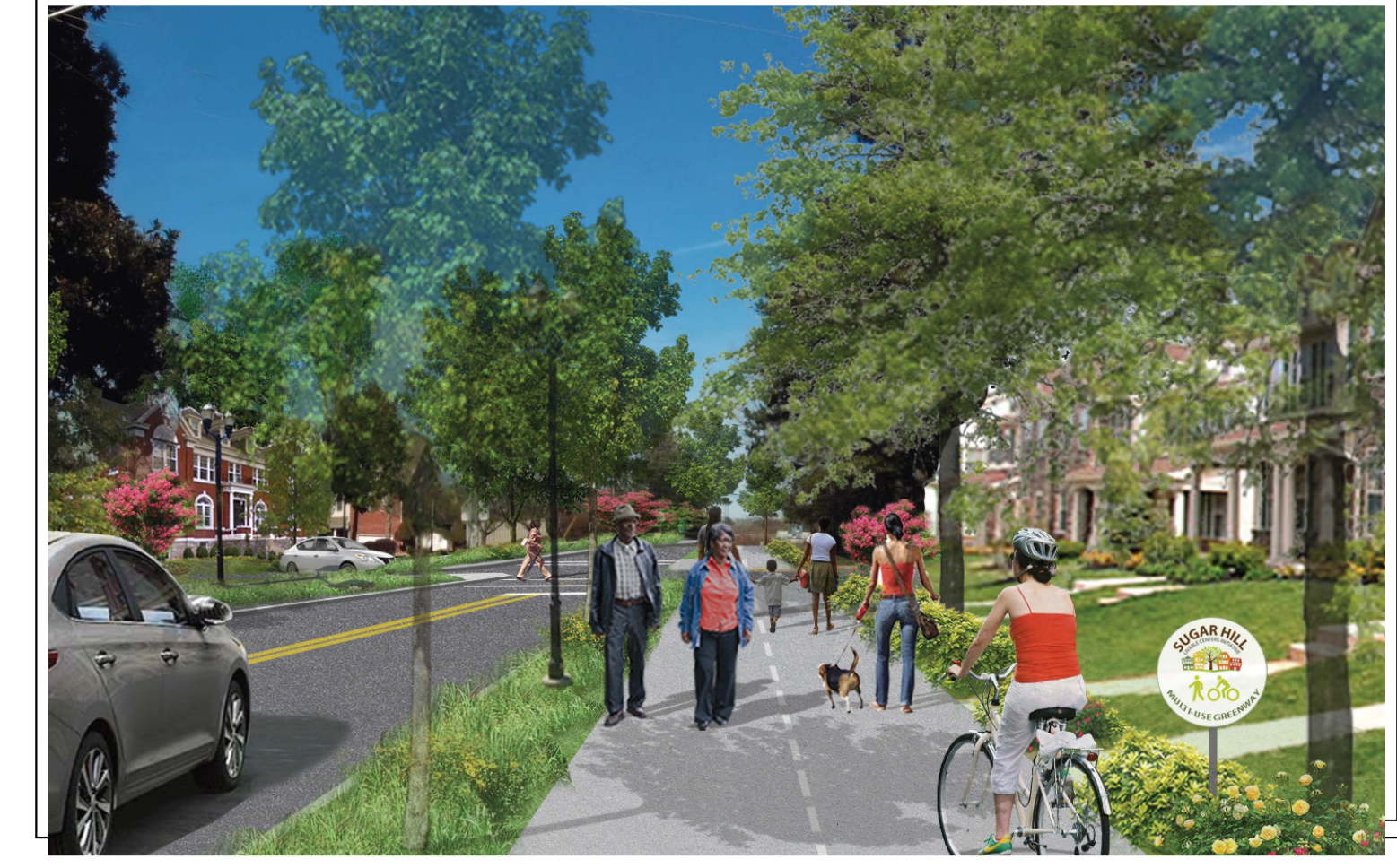
SUGAR HILL LIVABLE CENTER INITIATIVE DOWNTOWN MASTER PLAN

SHEET NUMBER: C3.1 NOT ISSUED FOR CONSTRUCTION