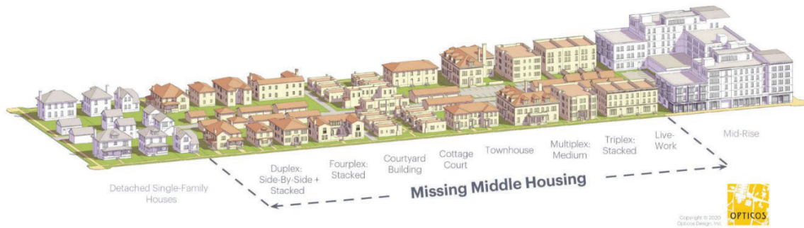
Figure 1 - Missing Middle Housing Types

continuum of building types suitable for transitioning from existing cul-de-sac style subdivisions to traditional pedestrian-oriented neighborhoods.