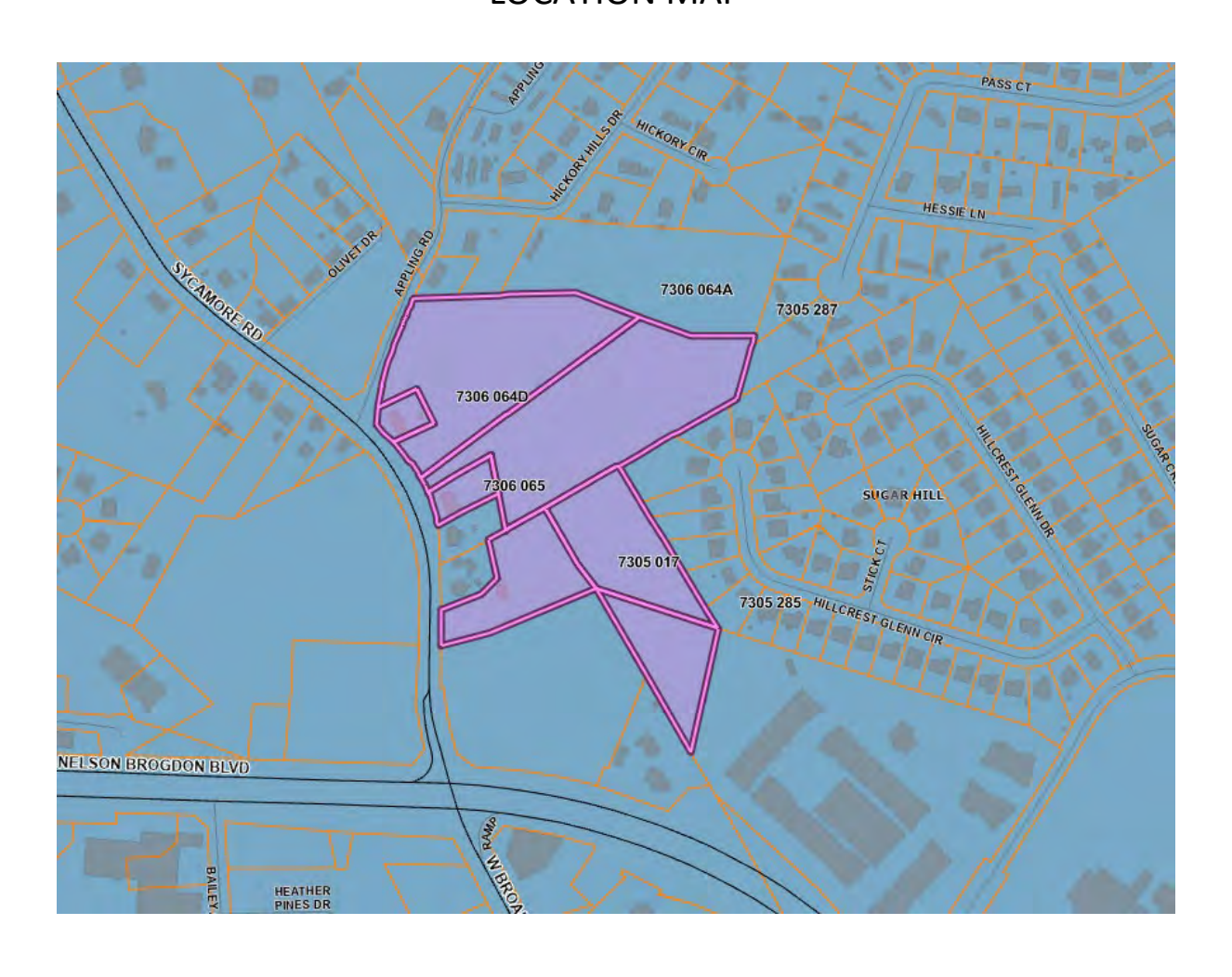
RZ-25-001 LOCATION MAP