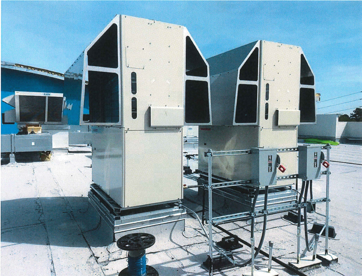
Two of the Yanmar Units in 2019.