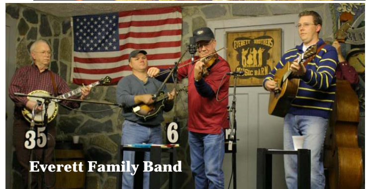
Everett Family Band