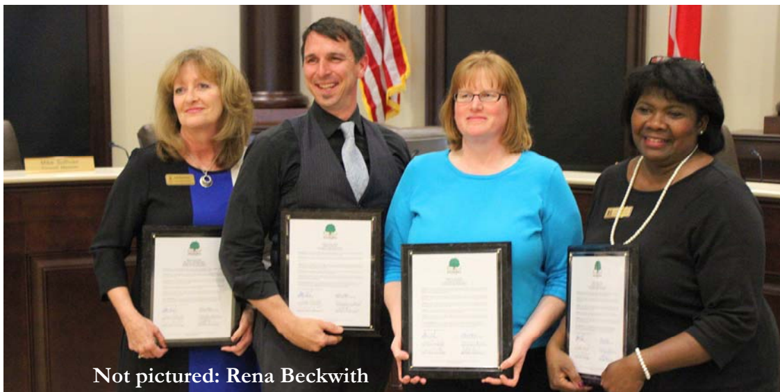
Not pictured: Rena Beckwith

7 years @ North Gwinnett High / 17 years total teaching